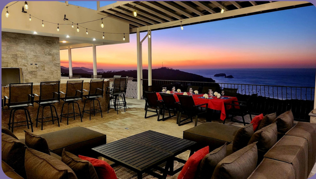
The Sky Deck with bar can hold up-to 50 guests for a sit down dinner

The Sky Sanctuary which is located on the 3rd floor of the villa