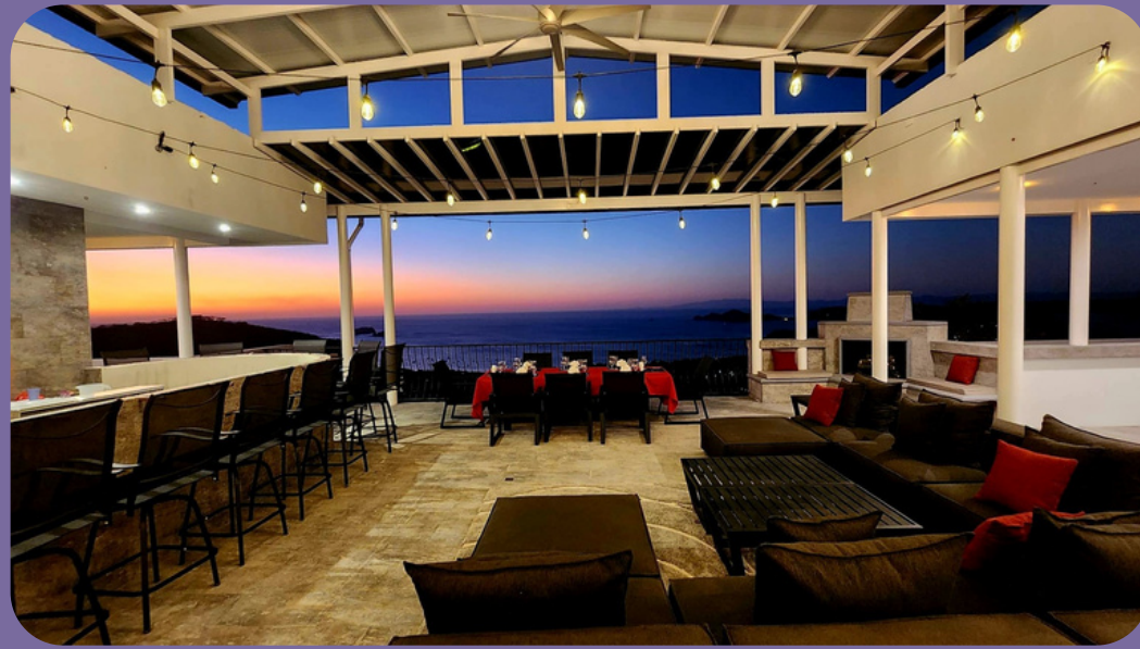
Views of the Sky Deck and the open area by the pool