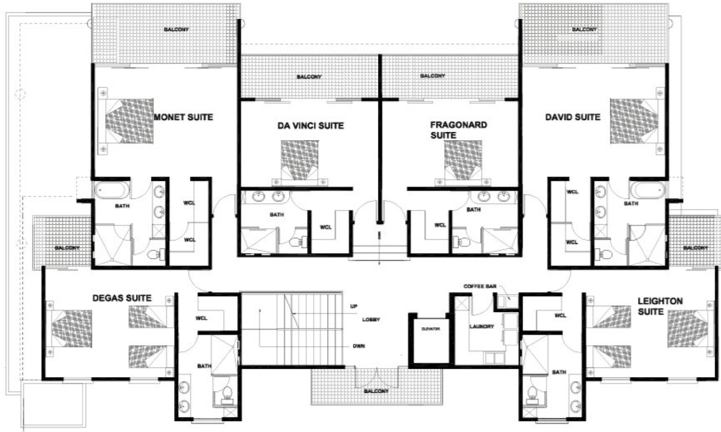
SECOND LEVEL PLAN