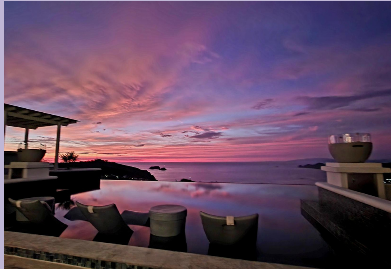
Wedding back drop of the Pacific Ocean 1,200 ft above sea level

Up-to 15 Guests $750 * 16 - 30 Guests $1,250 * 31 - 50 Guests $2,000